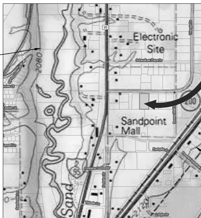
USGS TOPOGRAPHIC MAP