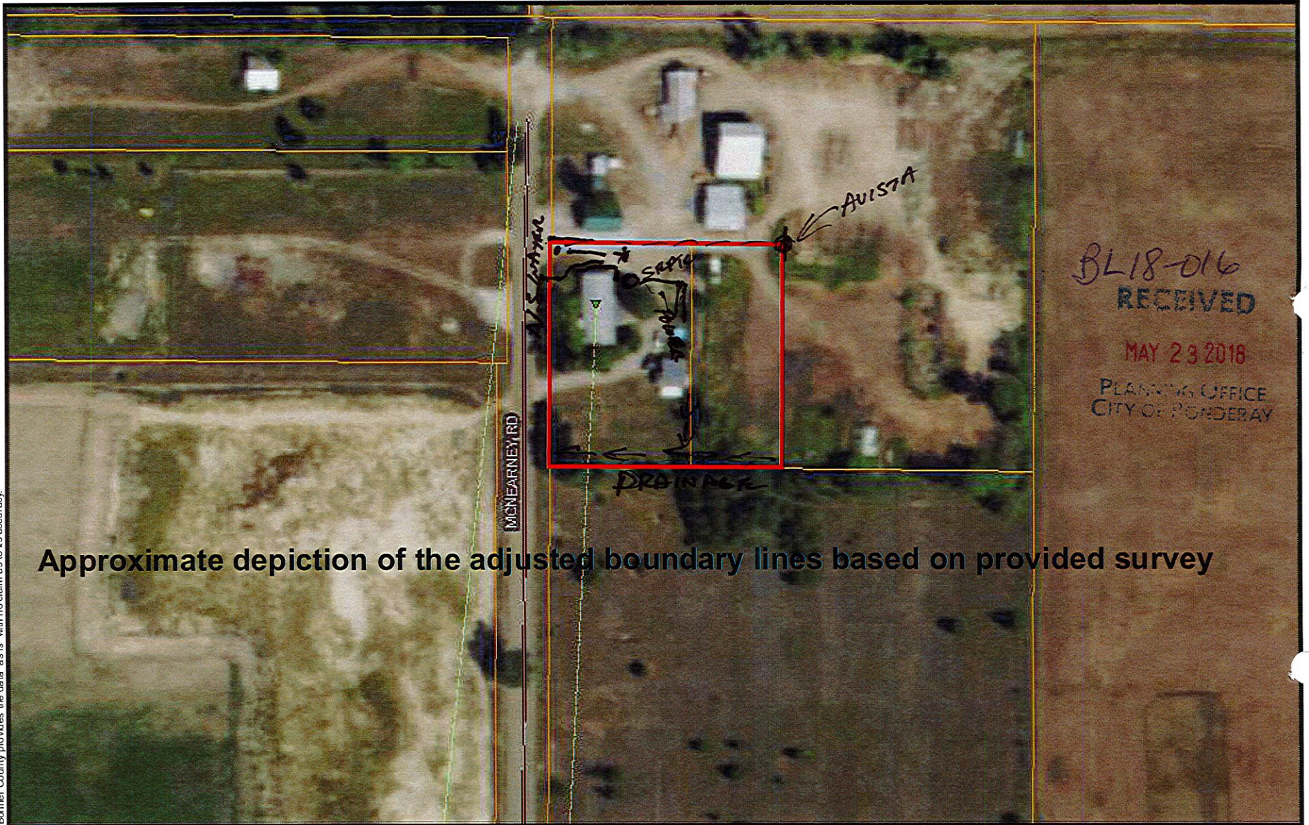
Approximate depiction of the adjusted boundary lines based on provided survey

Bonner County provides the data "as is" with no claim as to its accuracy.